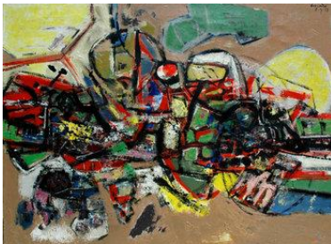
Corneille Jour d'Été 1957 Oil on canvas 67 x 90 cm Signed and dated upper right 'Corneille 8-7-57', Signed, inscribed and dated verso 'Jour d'été, Corneille, 1957'