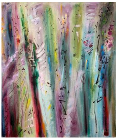
André Masson Rameau d'Or 1962 Oil on canvas 100 x 81 cm Signed vertical lower left