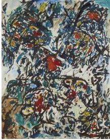
Asger Jorn Advanced Anti Geometric Space 1961 Oil on canvas 82 x 65 cm Signed lower right 'JORN'