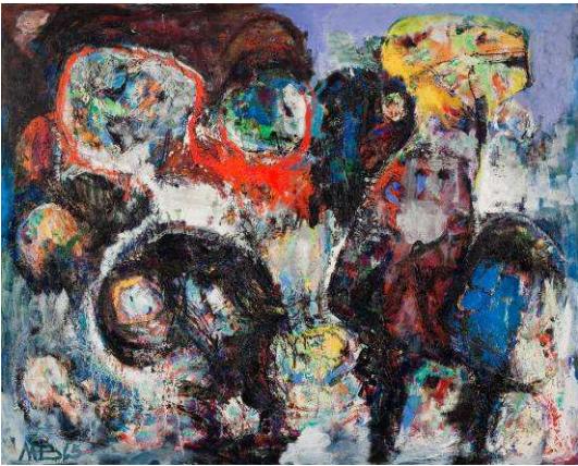
Mogens Balle Untitled 1965 Oil on canvas 100 x 125 cm