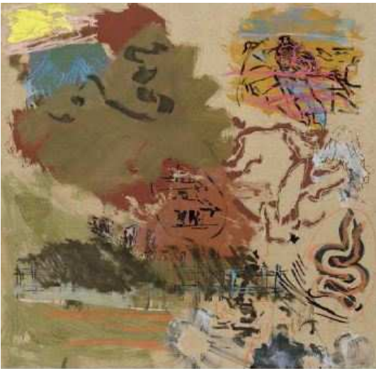
Per Kirkeby Untitled 2012 Mixed media on Masonite 122 x 122 cm