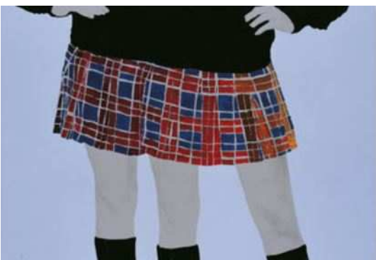
Robert Lucander Marja 2007 Acrylic and pencil on wood 70 x 100 x 2.5 cm