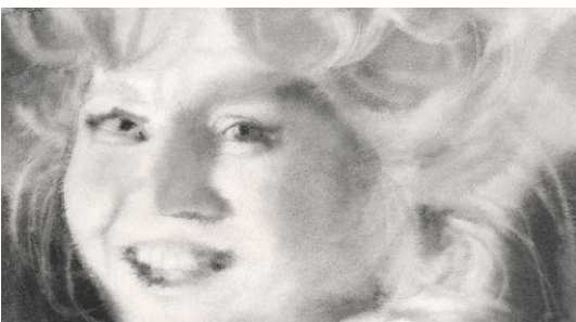
Maria Nordin Behind the Laughing Veil 2011 Installation consisting of 16 watercolors and video Each 21 x 30 cm