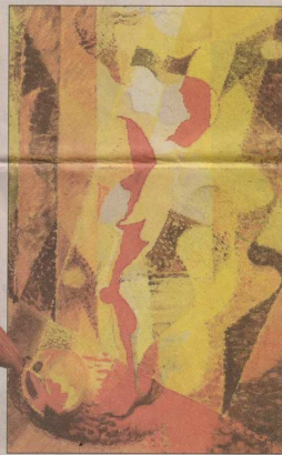
Die Galerie from Germany has some of the rarest paintings of artist Pablo Picasso. The gallery also has Andre Masson's painting from 1925, that has earlier displayed at various museums and exhibits. Other artists from this Gallery include Salvador Dali and Max Ernst. Booth No. B 19