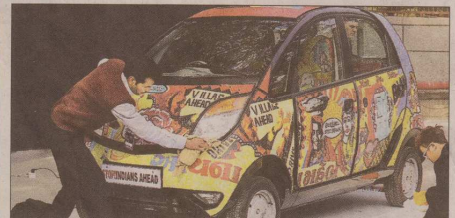
Stop! Indians Ahead by artist Ketna Patel is a part of the India Art Summit's nine individual art projects. The artist has converted the new Tata Nano into a symbolic Jewel of the Masses. Patel's current series juxtaposes high art with contemporary pop culture. The project is supported by Indigo Blue Art